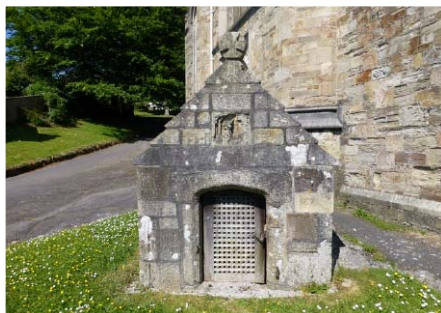
'St Guron's Well outside St Petroc's Church in Bodmin'